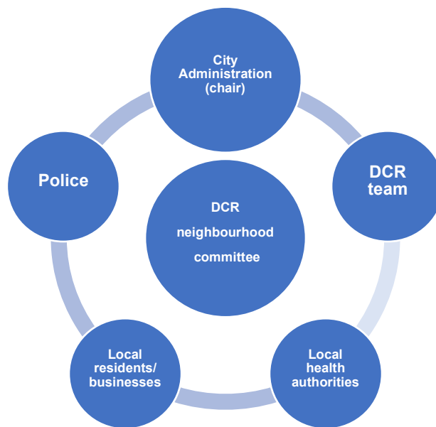
FIGURE 2 Composition of a DCR neighbourhood committee

DCR staff members also play an active role in neighbourhood committees, facilitating communication with people living or working in the vicinity of the DCR and helping to address public concerns (see Box 4). Ongoing communication between stakeholders and active cooperation between the municipality, local police and health and social service providers will play an important role for the successful implementation of DCRs. There is evidence to suggest that when neighbours are kept informed, their resistance is reduced and may even dissipate over time (e.g., Jauffret-Roustide and Cailbault, 2018).