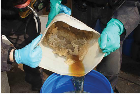
160 kg of MDMA were seized.