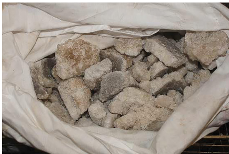
Calculation yield: approx. 1 300 000 MDMA tablets (120 mg concentration, average).