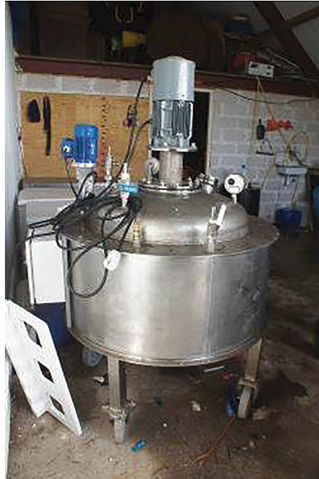
Similar equipment was seized in two locations, which was used for the illicit synthesis of mephedrone. As final product, 26 kg of mephedrone crystals were seized.

These combination sites (where two different products were being manufactured) clearly indicate that OCGs are not just limited to illicit sites where manufacture of traditional synthetic drugs takes place. They use opportunities and market demand to generate more profits.