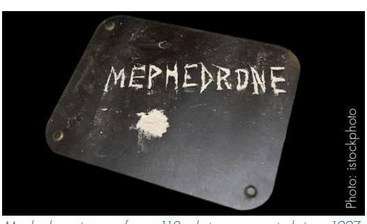
Mephedrone is one of over 110 substances reported since 1997.