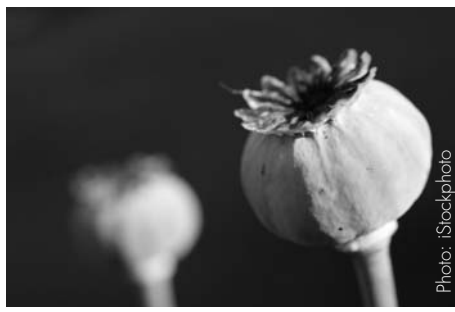
UNGASS review will be presented at next CND in 2008.

UNGASS set a series of benchmarks for the international community in the form of three key documents (2): a political