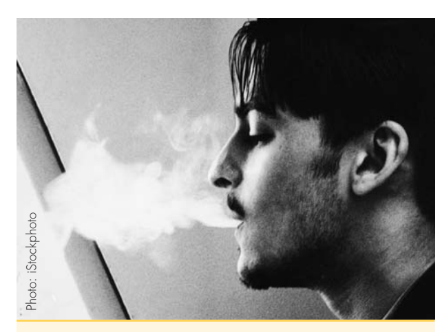
At present, scientific information on the actual extent of problem or dependent cannabis use among the general population is limited

At present, scientific information on the actual extent of problem or dependent cannabis use among the general population is limited. However, five countries — Germany, France, the Netherlands, Poland and