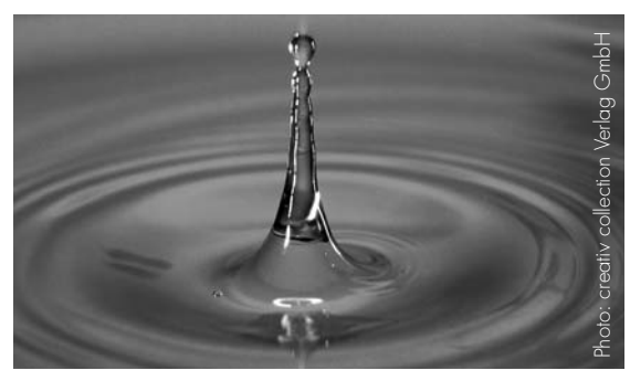
In aquae veritas? Improved methods to detect consumed drugs in waste water.