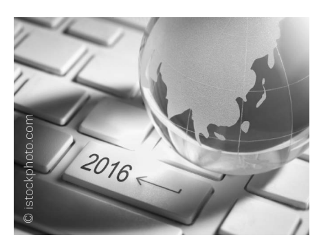
EMCDDA strategy and work programme 2016–18: now available online

The EMCDDA strategy and work programme 2016–18, which includes the annual work programme 2016, was published on the EMCDDA website on 21 January (¹). The document, adopted by the Management Board in December 2015, follows a comprehensive consultation of the agency's key stakeholders and partners as well as an exhaustive internal strategic thinking and programming exercise.