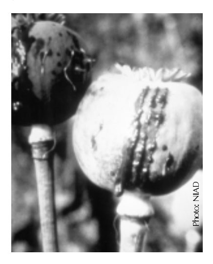
Participants at the CND assessed progress in the field of reducing the illicit demand for drugs and eradicating illicit drug crops, by reviewing the steps taken to date to achieve the goals set at the UNGASS.

Among these was a resolution – presented at the initiative of the United