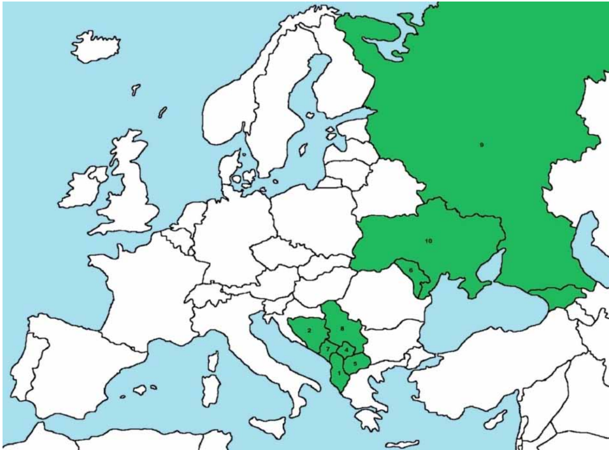
Figure 1: Places covered by the study

Legend – 1: Albania; 2: Bosnia and Herzegovina; 3: Georgia; 4: Kosovo*; 5: "the former Yugoslav Republic of Macedonia"; 6: Moldova; 7: Montenegro; 8: Serbia; 9: Russia; 10: Ukraine