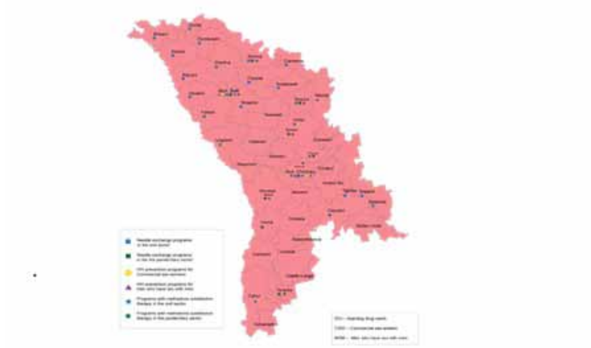
Figure 3: Development of needle exchange in Moldova: community and prisons