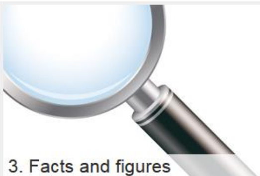
3. Facts and figures