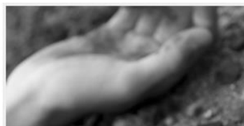
1. Analysis: preventing overdose deaths in Europe