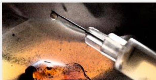
1. Analysis: overview of provision and evidence