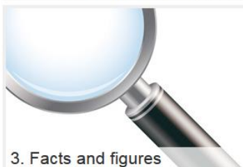
3. Facts and figures