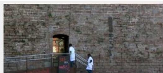
4. Service model for a supervised drug consumption facility