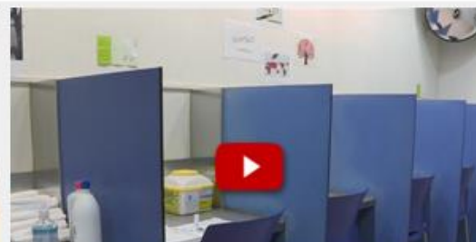
2. Video: drug consumption rooms