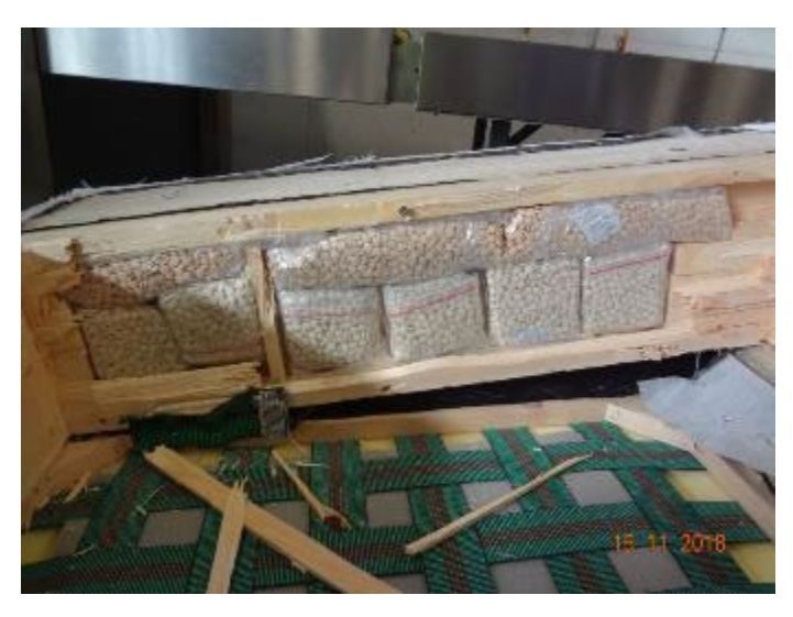
FIGURE 4 Captagon tablets concealed within furniture, Germany, 2018

2018 or before (samples provided in March 2018 by the Lebanese authorities).