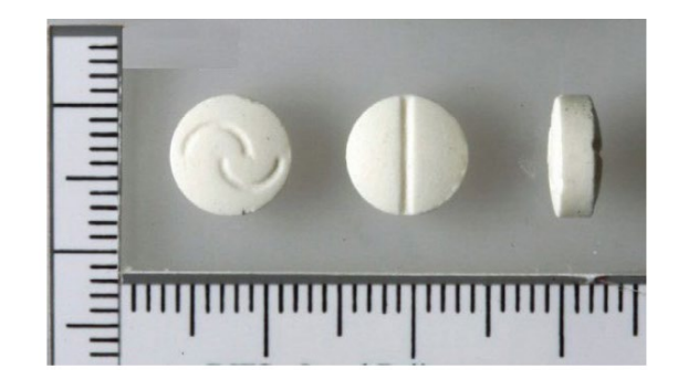
FIGURE 2 Examples of illicit captagon tablets