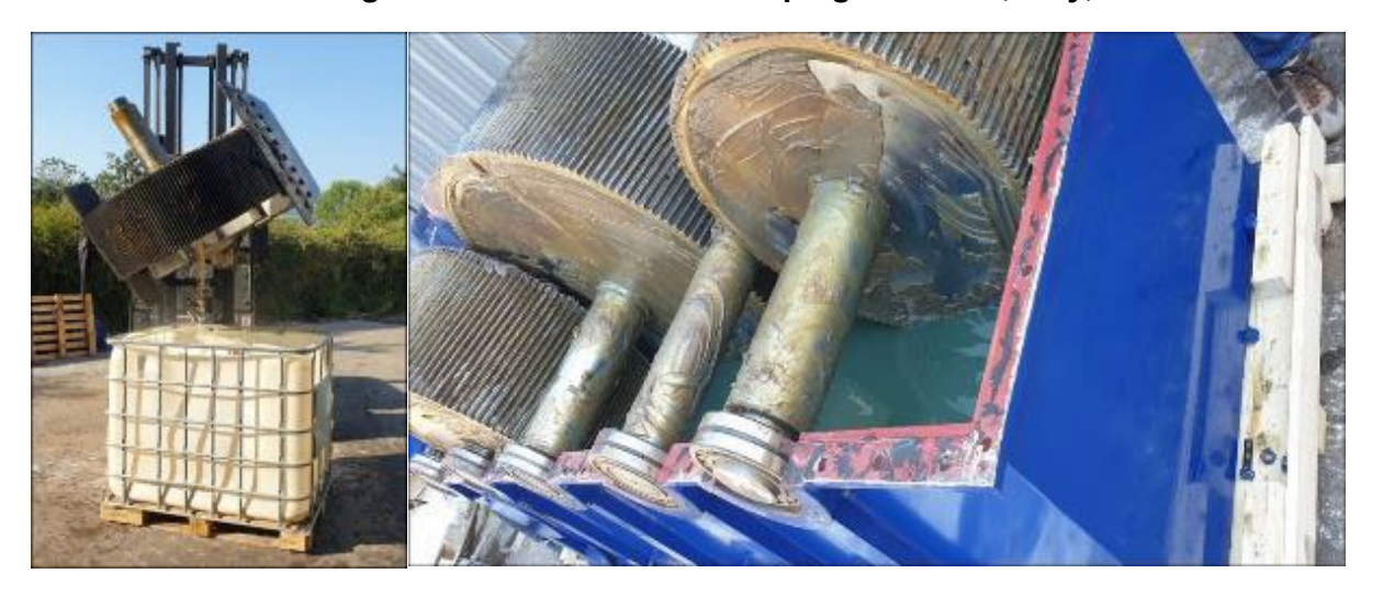
FIGURE 9 Parts of an industrial gearbox used to conceal captagon tablets, Italy, 2020