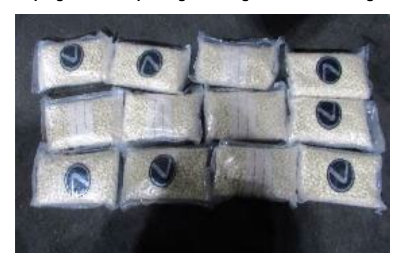
FIGURE 11 Captagon tablets packaged in bags with a Lexus logo