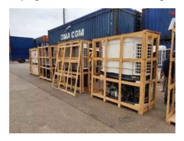
FIGURE 10 Captagon tablets concealed in refrigeration units, Romania, 2020