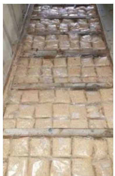
FIGURE 6 Captagon tablets found in a shipping container, Greece, 2018

In March 2019, in Igoumenitsa Port, three Bulgarian citizens were arrested in possession of 370 000 captagon tablets. The suspects had travelled from Bulgaria in two cars and were heading to Italy.