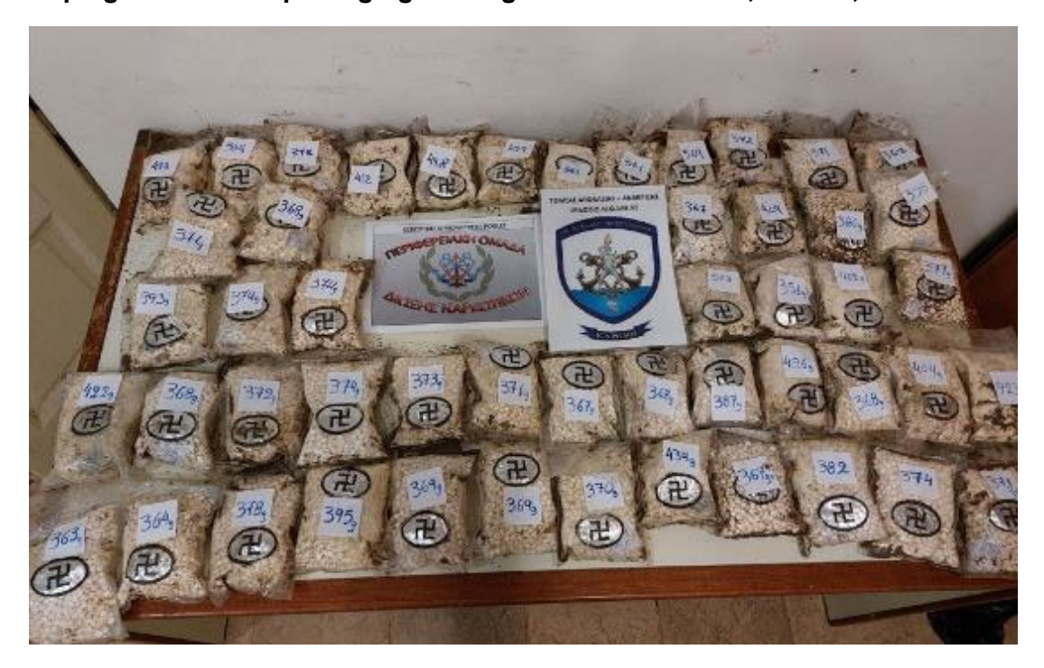
FIGURE 8 Captagon tablets in packaging bearing inverted Swastika, Greece, 2022

Finally, in January 2022 over 180 000 captagon tablets were found washed up on the shores of the island of Rhodes. On the same day over 80 000 captagon tablets were found on the shores of the island of Kastellorizo. Shortly afterwards, in February 2022, a further 88 880 captagon tablets were again washed up on the shores of Rhodes. In these cases, the packaging had labels displaying an inverted swastika (the only instance of this detail found in all the cases reported) (see Figure 8).