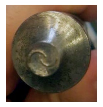
FIGURE 3 Tablet punches with the characteristic Captagon logo comprising two half-moons, found in dismantled illicit laboratories

On a note of caution, the information available, including recent information from analyses of captagon tablets seized in Europe, suggests that amphetamine and often caffeine are the psychoactive substances most likely to be present, although it should also be noted that tablet content can vary (for instance, some tablets also contain theophylline). In a limited number of cases, methamphetamine has been found instead of amphetamine (EMCDDA, 2018b).