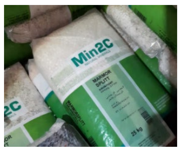
FIGURE 5 Packages of marble stones used to conceal captagon tablets, Germany, 2021

The second case, from May 2021, was a seizure of 234 kilograms of captagon tablets in Bavaria, concealed in bags of small marble stones from Austria (see Figure 5). A suspect in this case, and the person believed to be behind the scheme, was a Lebanese national, who also featured in cases investigated by Austrian police. Some of the tablets in this case were subsequently linked by forensic examination to the third German seizure in August 2021, also in Bavaria, when 170 kilograms of captagon tablets was seized on the road network during a random traffic control. The suspects in this case were two Turks, a Greek and a Romanian.